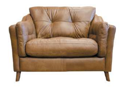
SNUGGLER W: 130cm H: 85cm D: 98cm