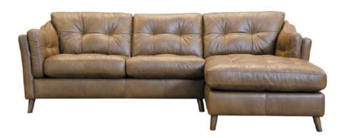
4 SEATER SOFA WITH CHAISE RHF W: 253CM H: 85CM D: 156CM

The Saddler sofa collection from Alexander & James offers you slouchy, relaxing comfort with flair. Featuring squidgy arm pads and pin tuck detailing in soft, natural buttery leather colours, once you sit on a Saddler you won't want to move! With a choice of leg colours and gorgeous leathers, what's not to love. Available as a 4 seater sofa with chaise, 3 seater sofa, 2 seater sofa, snuggler and armchair, there's plenty of choice to create the sitting room you desire.