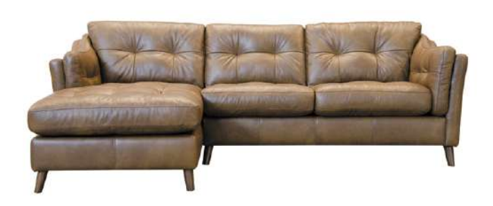
4 Seater Sofa With Chaise LHF W: 253Cm H: 85Cm D: 156Cm