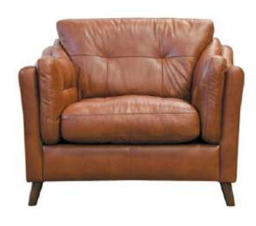
ARMCHAIR W: 109cm H: 85cm D: 98cm