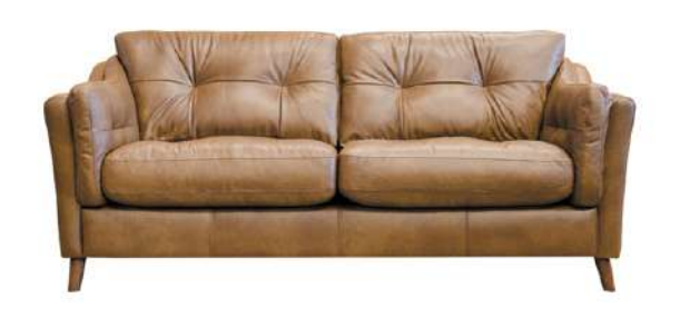
2 Seater Sofa W: 179cm H: 85cm D: 98cm