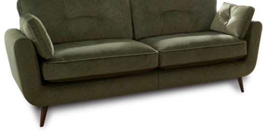
3 Seater Sofa W: 195cm D: 95cm H: 88cm