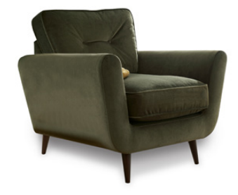
Armchair W: 96cm D: 95cm H: 88cm