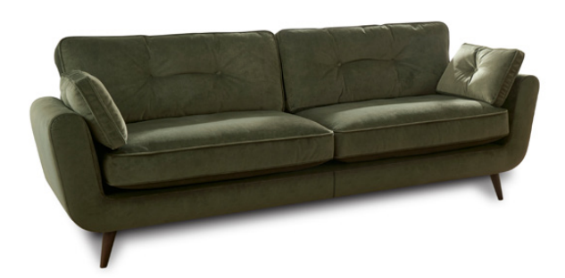
3.5 Seater Sofa W: 225cm D: 95cm H: 88cm

The Mendel is modernity personified, with its sleek modern tailoring showcased in each piece and its eco-friendly credentials. This beautiful sofa collection has been designed and built to meet the ever changing needs of the planet and our homes and clearly demonstrates that fashion and comfort don't have to be compromised to save the planet. Featuring clean lines, comfy arm cushions, sleek tapered legs and a great choice of fabric colours, the Mendel is a true triumph. Choose from a great selection of sofas including a 3.5 seater sofa, 3 seater sofa, 2 seater sofa, snuggler, armchair and footstool to create a living room that meets your needs.