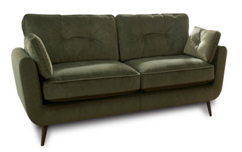
2 Seater Sofa W: 165cm D: 95cm H: 88cm