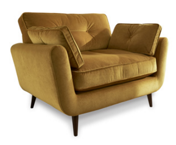
Snuggler W: 131cm D: 95cm H: 88cm