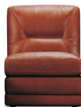
MODULAR 1 SEATER SOFA NO ARMS W: 69CM D: 100CM H: 91CM SH: 51CM