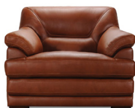
ARMCHAIR W: 115CM D: 100CM H: 91CM SH: 51CM