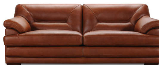
3 SEATER SOFA W: 200CM D: 100CM H: 91CM SH: 51CM