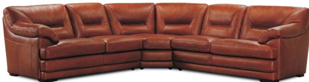
MODULAR 3+3 SEATER CORNER SOFA SIDE 1 W: 297CM SIDE 2 W: 297CM D: 100CM H: 98CM SH: 51CM

The Giuseppe sofa collection offers great choice in terms of the range of sofa sizes available, the choice of leather grades and the colours available for the discerning customer to choose from. This delightful sofa range offers both static and modular versions whereby you can customise the exact corner sofa that will suit your individual needs. The sofas and chair have lovely high backs with padded detailing, stylish and padded armrests and removable seat cushions. Choose from a 3.5 seater sofa, 3 seater sofa, 2 seater sofa, armchair and a choice of modular pieces to make your particular sized corner sofa.