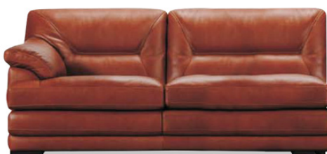
MODULAR 3 SEATER SOFA ARM ON LEFT W: 169CM D: 100CM H: 91CM SH: 51CM