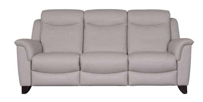
3 SEATER SOFA STATIC/ELECTRIC RECLINING/ELECTRIC RECHARGEABLE RECLINING W: 207CM D: 98 - 158CM H: 100CM SH: 51CM

The Parker Knoll Manhattan sofa collection is a true classic, with clean sweeping lines, high back comfort and deep cushioning. Handmade in Britain by expert craftsmen using the latest innovations in premium comfort technology, the Manhattan is available in soft touch fabric or fine leather, and with either mahogany or teak feet options. The electric reclining and rechargeable reclining options are powered with a modern-style USB port, and offer everything you need to relax. This collection offers an armchair, 2 seater sofa, and 3 seater sofa, all available in static, electric reclining and electric rechargeable reclining options.