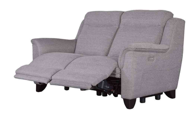
2 SEATER SOFA STATIC/ELECTRIC RECLINING/ELECTRIC RECHARGEABLE RECLINING W: 162CM D: 98 - 158CM H: 100CM SH: 51CM