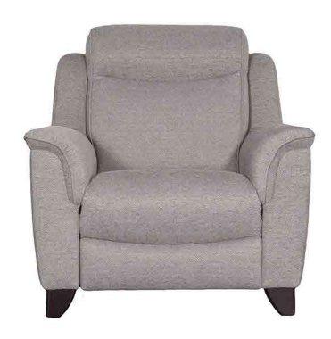
ARMCHAIR STATIC/ELECTRIC RECLINING/ELECTRIC RECHARGEABLE RECLINING W: 98CM D 98 - 158CM H: 100CM SH: 51CM