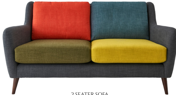
2 SEATER SOFA W: 164CM D: 104CM H: 85CM