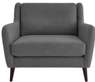
SNUGGLER W: 128CM D: 104CM H: 85CM