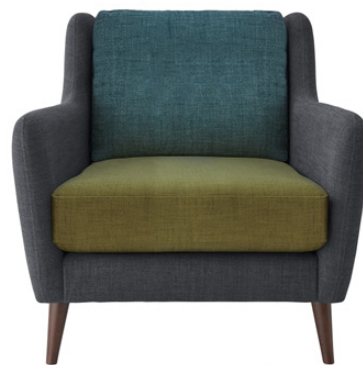
ARMCHAIR W: 88CM D: 104CM H: 85CM